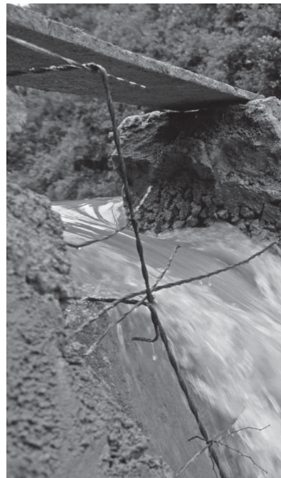
An irrigation dam on the frontier zone of India's federal states of Andhra Pradesh and Orissa has broken following heavy monsoon rains.

Higher temperatures will further increase the rate at which water evaporates from oceans, lakes and reservoirs and from the soil surface. This reduces supplies in storage reservoirs and dries the soil more quickly after rainfall or irrigation. Higher temperatures will also have an effect on water quality and the overall ecology of streams and water bodies.