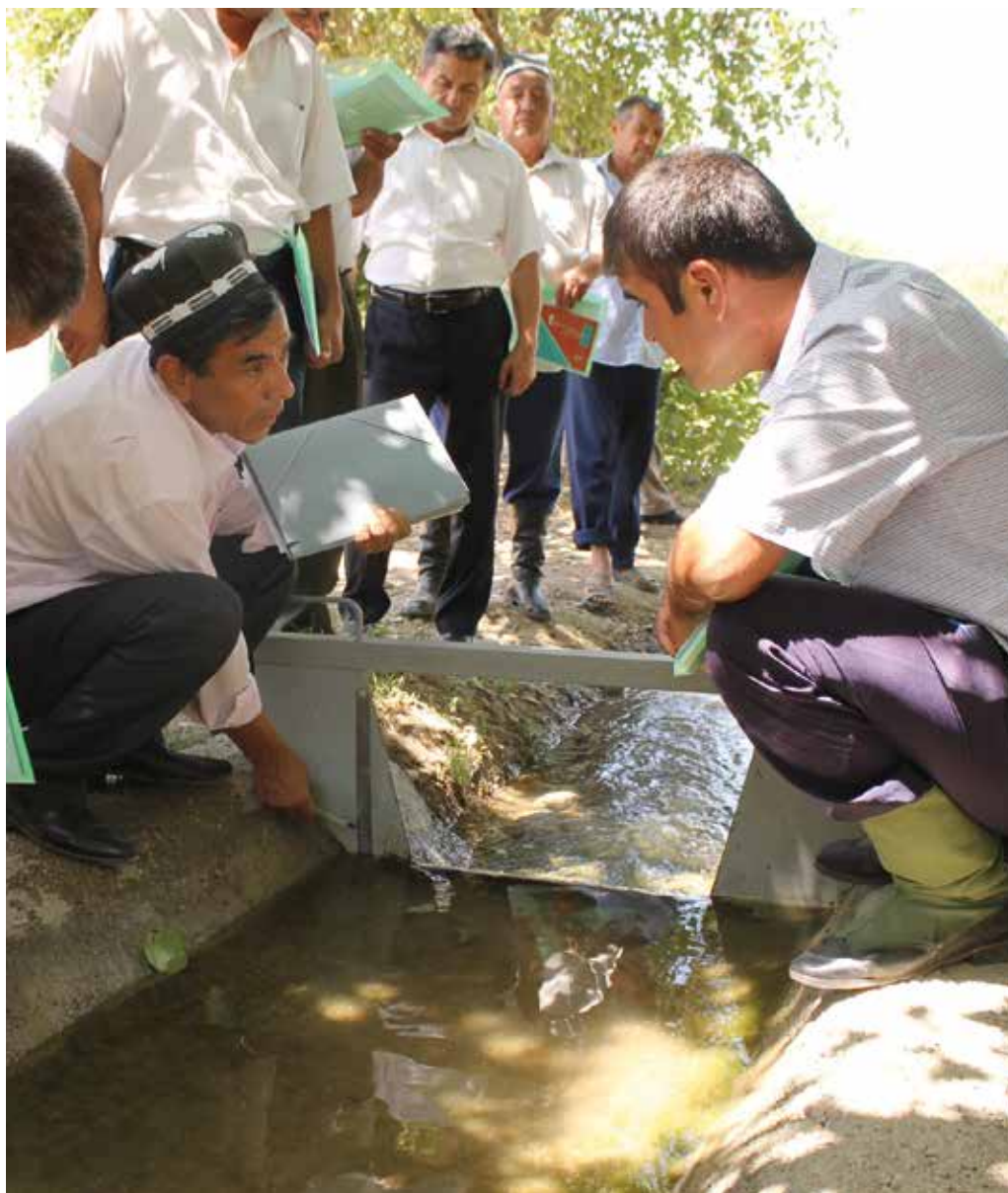
Training on exact water quantity measuring in Tajikistan.

While the Sustainable Rice Platform (SRP), the Alliance for Water Stewardship (AWS) and the Better Cotton Initiative (BCI) are project steering partners, providing guidance to farmers on sustainable production and water stewardship, WAPRO’s experience and evidence help the standard revision processes. For example, the project plays an important role in rolling out the new Water Stewardship Principle of the BCI standards globally, and its experience in implementing water stewardship at farmer level is fed into the technical committee of AWS.