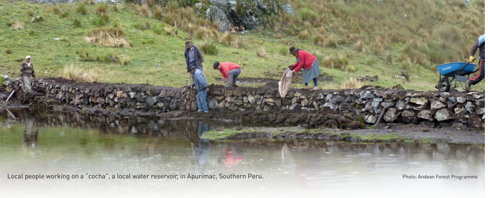
Local people working on a "cocha", a local water reservoir, in Apurímac, Southern Peru.