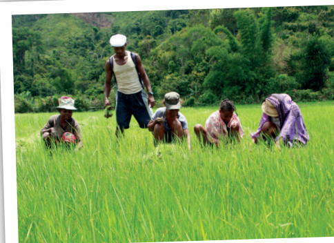
Rice fields in a multifunctional cultural landscape in Eastern Madagascar.

Similar to forests in the Himalayas, mountain forests in the Andes provide a wide range of services and benefits to local communities and many other stakeholders. The Andean Forests Programme is a regional initiative to support Andean communities in adapting to climate change and to ensure the continuity of social, economic and environmental benefits provided by Andean forests in the long run. Established in 2014, the programme works closely with government agencies at different levels, communities, research, the private sector and other stakeholders in Colombia, Ecuador, Peru, Bolivia and Chile. It is funded by the Global Programme Climate Change and Environment of SDC and facilitated by a consortium comprising Helvetas and Condesan (the Consortium for Sustainable Development of the Andean Ecoregion).