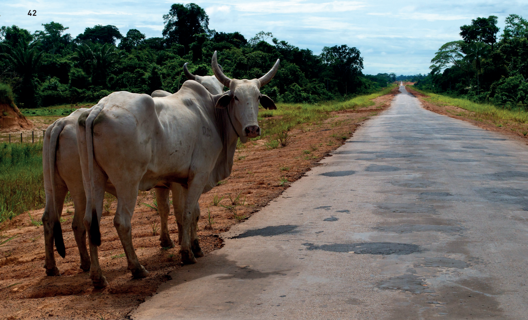
Roads and cattle farming are two major drivers of deforestation in the Brazilian Amazon.