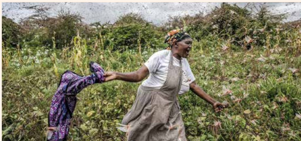
In 2020, East Africa experienced the worst infestation of desert locusts in over 25 years.

In 2020, areas of East Africa experienced a rapid-succession series of severe health and environmental crises: COVID-19, devastating floods and the worst infestation of desert locusts in over 25 years. These events each impacted local food systems and compounded one another, increasing the vulnerability of local populations and reducing their ability to engage in social distancing and to practise basic hygiene measures. The same weather conditions that contributed to the locust infestations also affected crop growth and food prices. Food supplies diminished by the locust pest were further diminished by flooding, deepening local food insecurity.