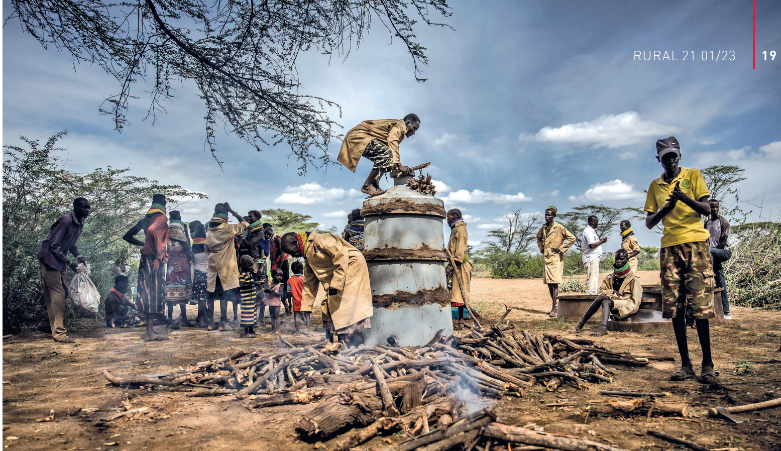
Members of a group belonging to the Turkana community closing a steel ring kiln to prepare charcoal next to their village in Morungole, Turkana County, Kenya. The group has substantially transformed its livelihood, hacking down the invasive trees called Mathenge and turning them into charcoal.