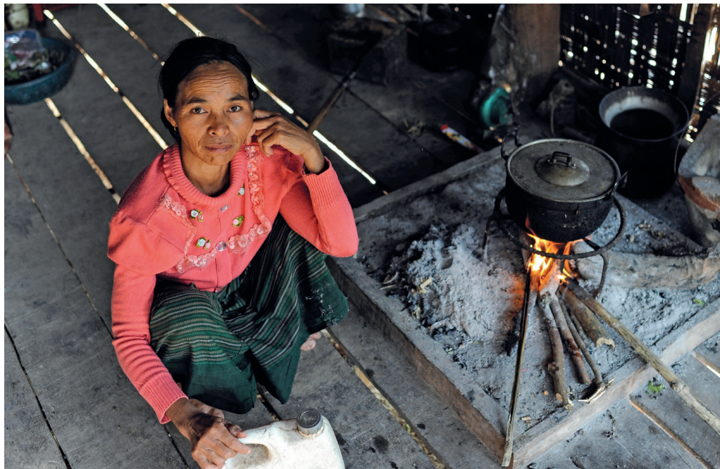
Conventional use of fuelwood is frequently associated with indoor air pollution and related health repercussions.

While traditional wood energy value chains may have direct or indirect repercussions on forest landscapes, eradicating them abruptly is both difficult and inappropriate given that millions of people rely on them for both their energy needs and their livelihoods; the transition