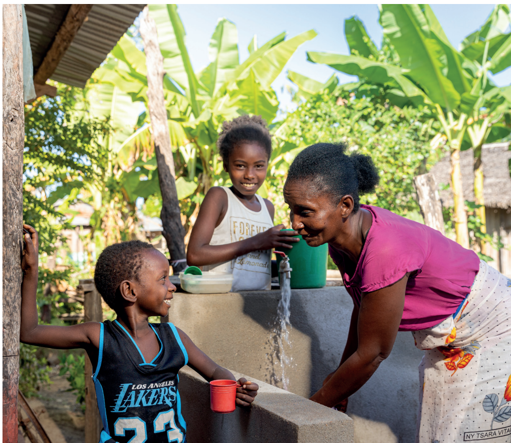
The HWISE Scale is being piloted as part of a baseline survey of 8,400 households in 50 villages in Madagascar that will be connected to water service with the support of the organisation water: charity.

Near the turn of the century, experiential food insecurity measures were developed to provide a more complete picture of the global food crisis. These experienced-based tools, which capture dimensions of food access, quality and use, have received widespread recognition and helped demonstrate that food insecurity is a prevalent issue. The tools have also been used to identify at-risk groups and inform the creation of more effective strategies for reduc-