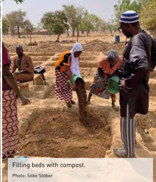
Filling beds with compost.