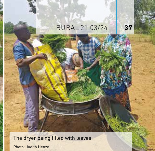
The dryer being filled with leaves.