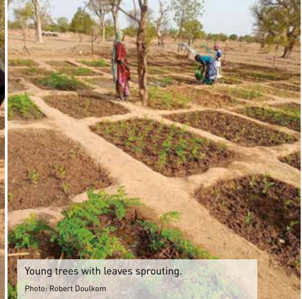
Young trees with leaves sprouting.